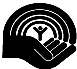
United Fund, circa 1970

Most states mandate that “confusingly similar” marks will not be granted state registration status. Thus, your state registrations provide direct protection against registration of other marks which may be “confusingly similar.” This provides a hedge against dilution of your mark.